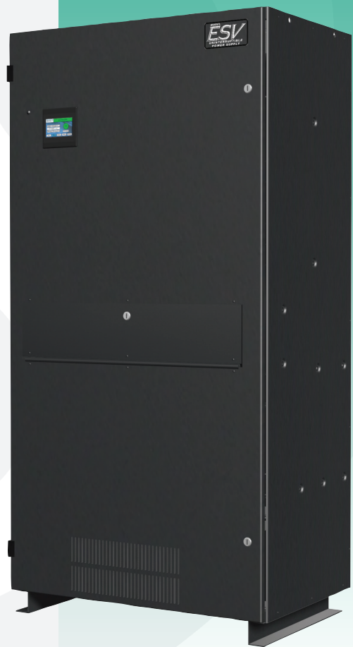
14 kVA/kW model shown

If some or all of these features are on your "must include" UPS checklist ... don't compromise! Choose the "Model ESV" Uninterruptible Power System ... the complete, integrated back-up power solution!