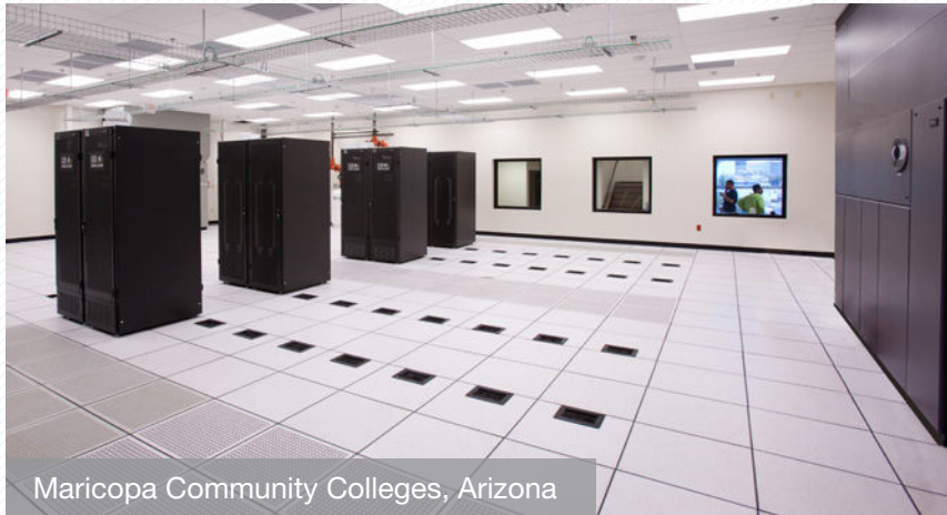
Maricopa Community Colleges, Arizona

Data Centers, Computer Rooms and Mission Critical Environments are very specialized and selecting the right Contractor is one of the most important decisions you will make. With over 27 years of experience, Titan Power is at the forefront of data center industry knowledge with up to date technology. Titan Power's highly trained team of Architects, Engineers and Consultants has decades of knowledge in designing and building secure, efficient and cost effective data centers.